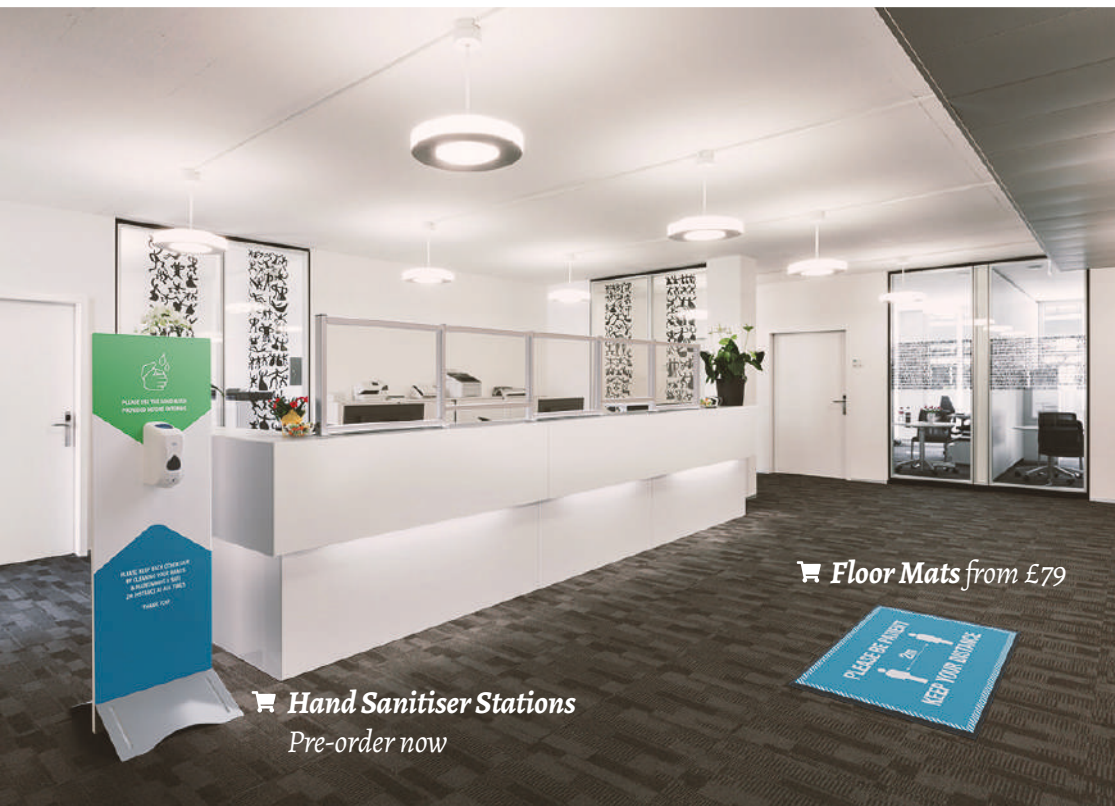
🛒 Floor Mats from £79