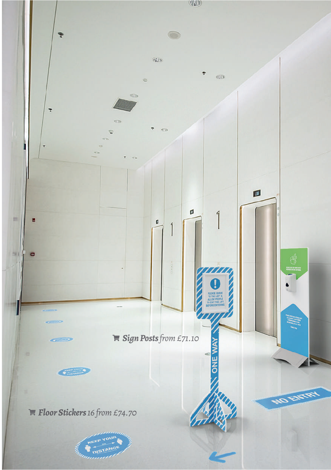
🛒 Sign Posts from £71.10